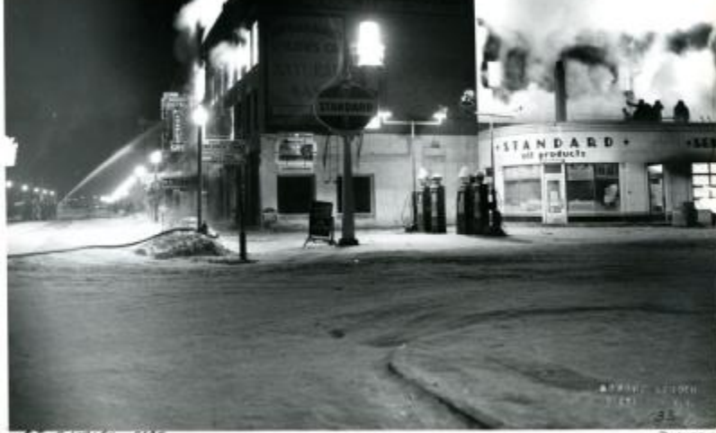
ST. CHARLES FIRE