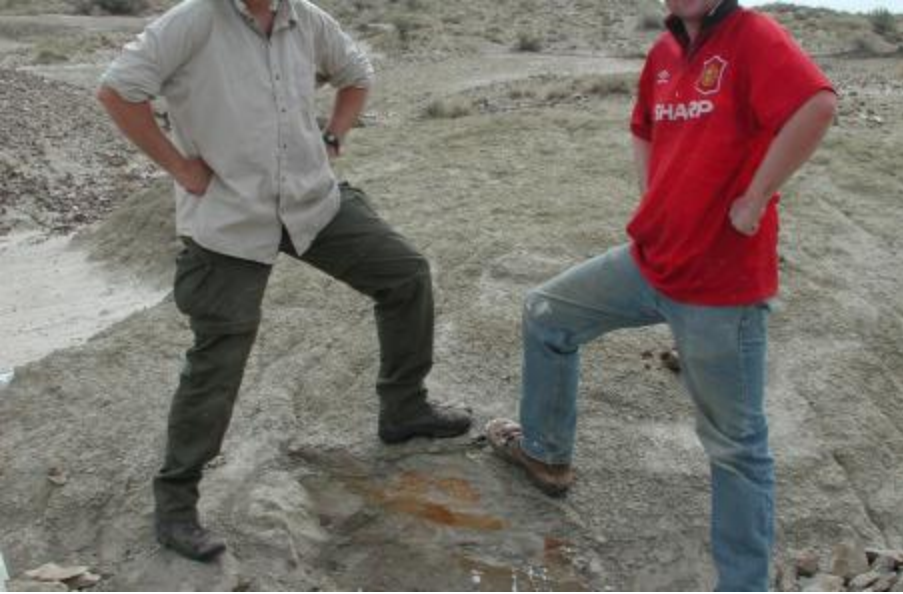
Two New Transitional Species Fill In Missing Links In The Evolutionary History Of Horned Dinosaurs