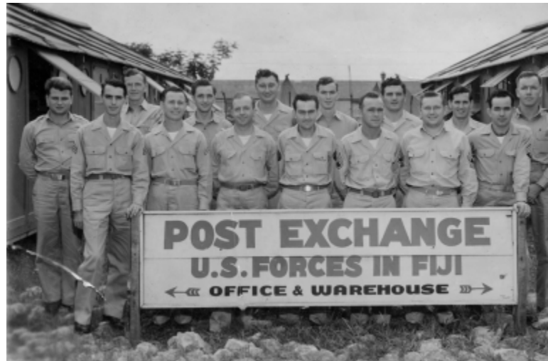
Some Soldiers From Co. K Outside The PX