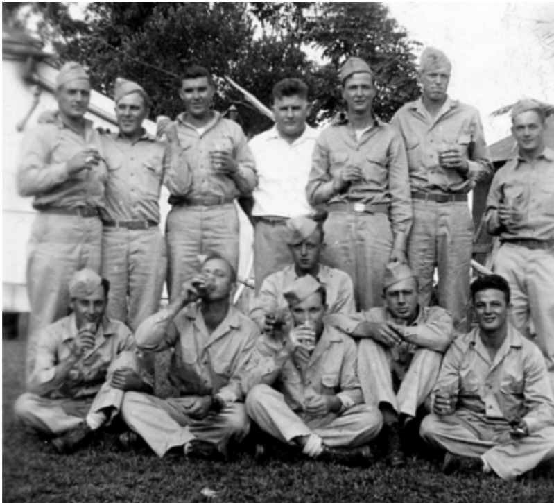
Soldiers From Company K While On R&r At Fiji In 1943.