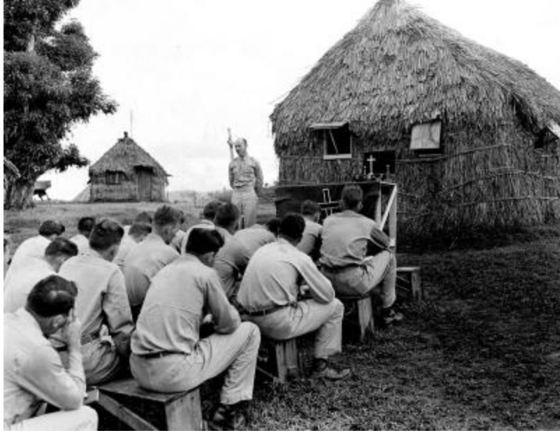
Field Church Service While At Fiji.