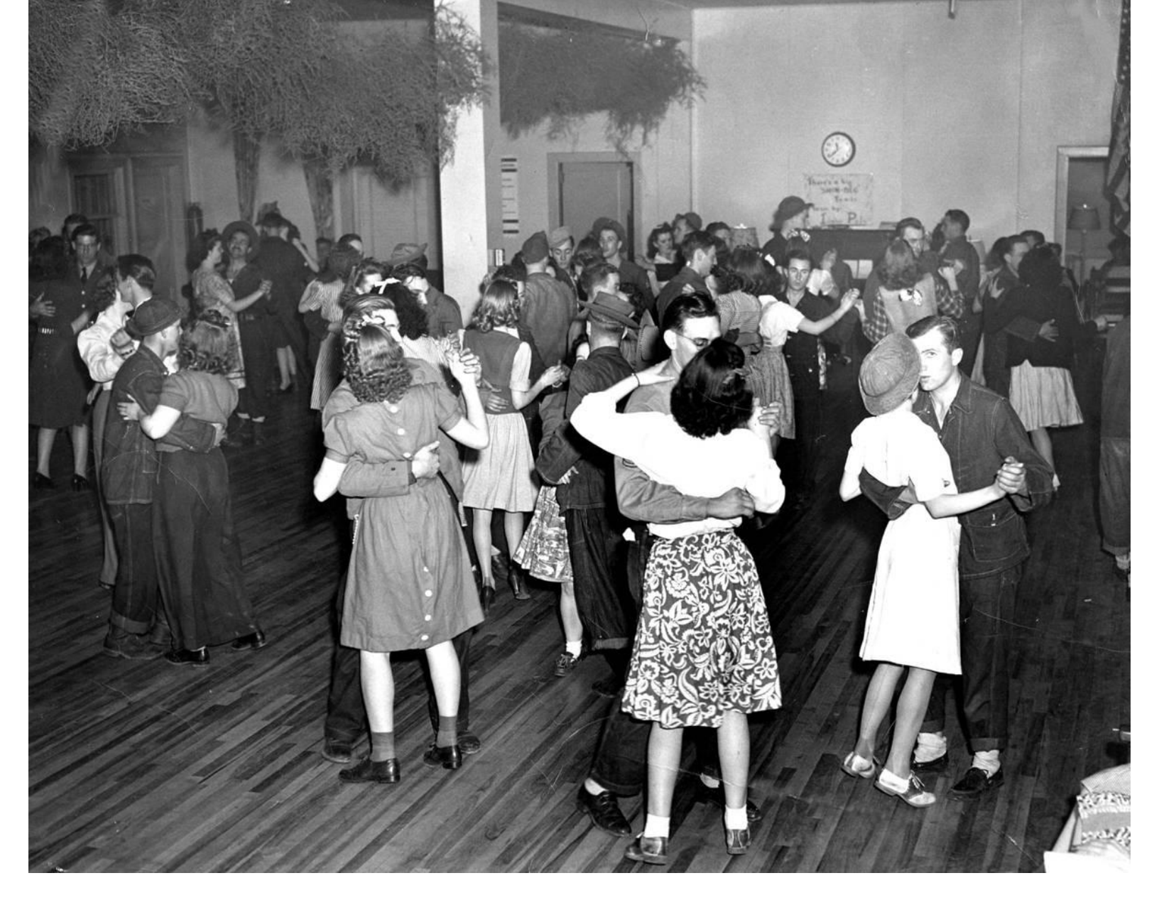
USO dance in Hermanston, Oregon in February 1942, just before Company K departed for the South Pacific.