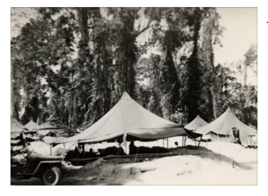
Company K To Australia.

Tents On New Caledonia - Pacific Theater.