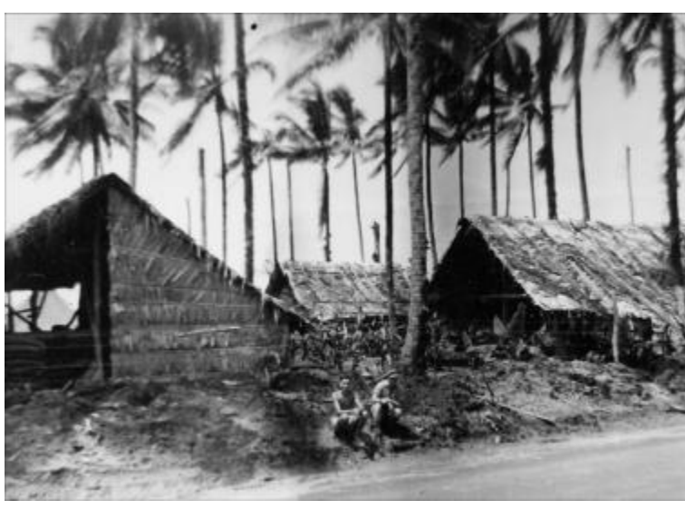
Hurriedly Built Sleeping Quarters On New Caledonia.