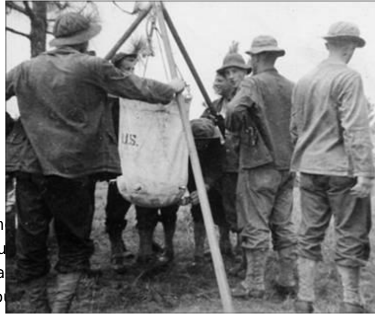
The Du Ba Lo (Circa 1941)