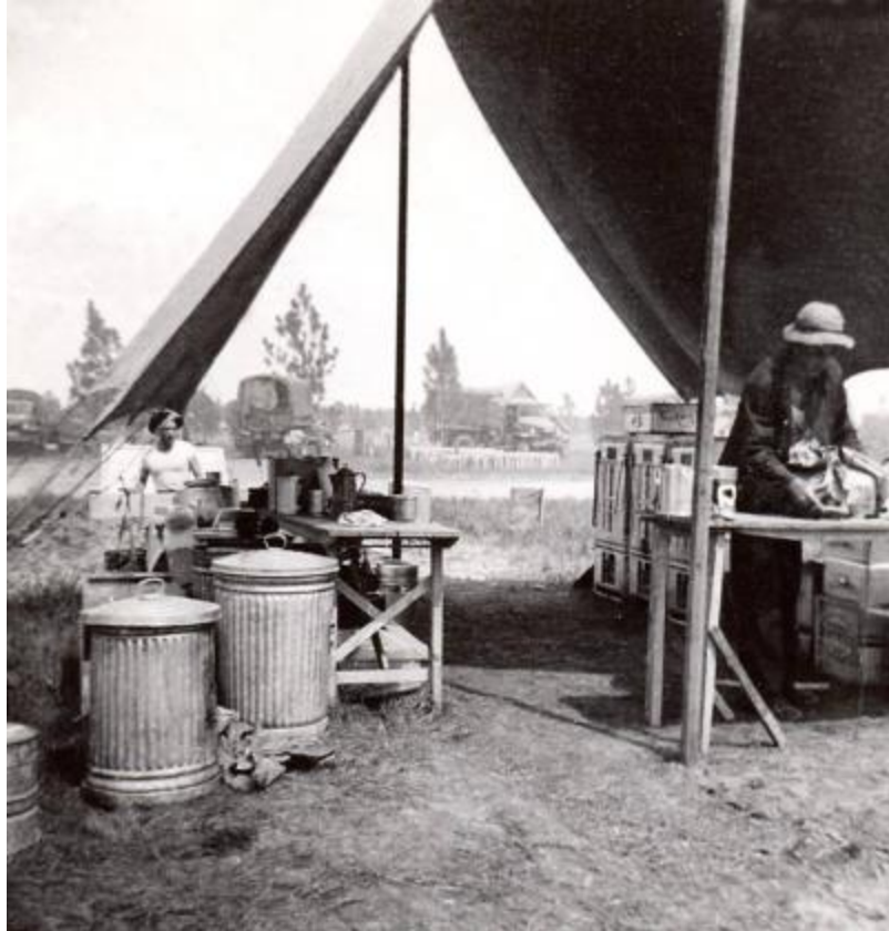
The Company K Cooks Prepared Meals In This Field Kitchen When The Soldiers Were On Maneuvers.