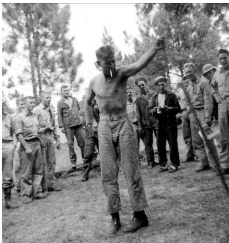
Taking A Break While On Maneuvers.