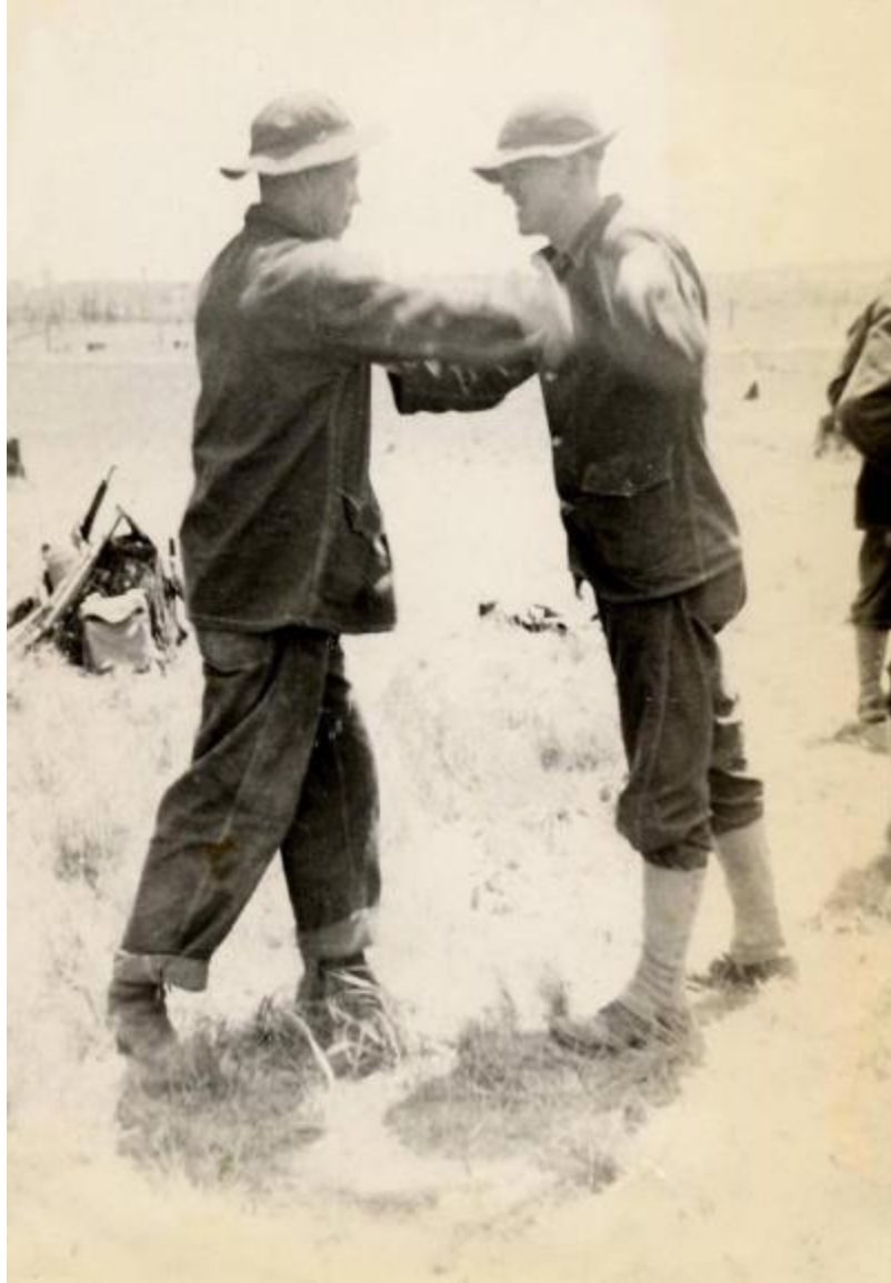
Soldiers Practicing Hand To Hand Combat Drills At Camp Claiborne.