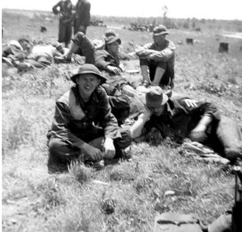
Company K Soldiers Take A Break After Chow.