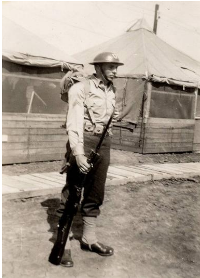
Seen Here With A Full Pack. These Were

The Uniforms That Were Standard Issue During WWI. It Was Only Later In Their Training That The Soldiers Of Company K Received The Uniforms That We Recognize Today As Being Used During WWII.