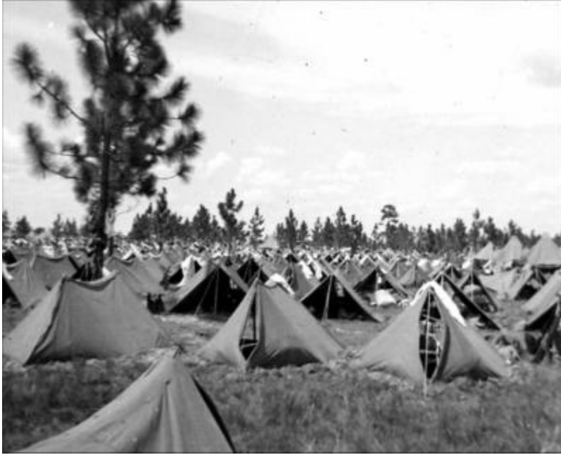
Tents That Housed Soldiers During Field Maneuvers