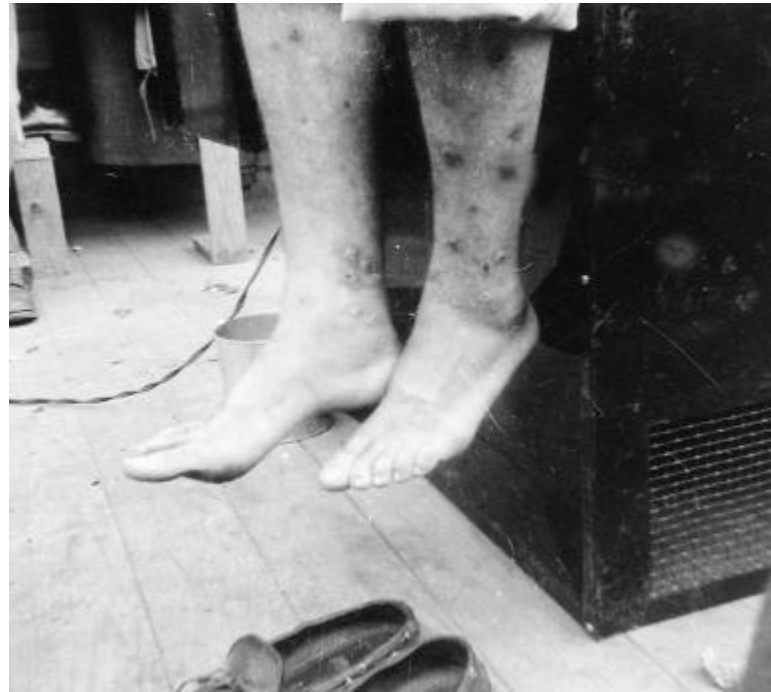
Chigger Bites Suffered While Training At