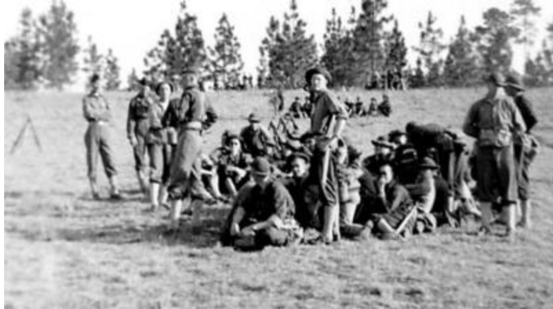
Soldiers Of Company K Are Seen Here Taking A Short Rest While Training During Field Maneuvers At Camp Claiborne.