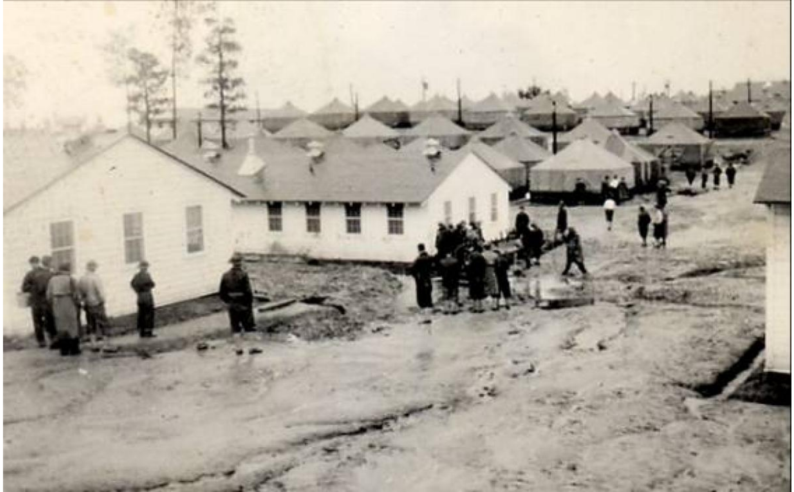
Some Days Were Miserable And Muddy At Camp Claiborne.