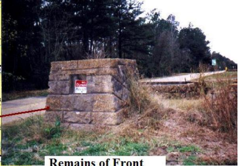
Remains of Front Gate Camp Claiborne, Louisiana

Camp Claiborne was located in the Kisatchie National Forest at Forest Hill, approximately 17 miles south of