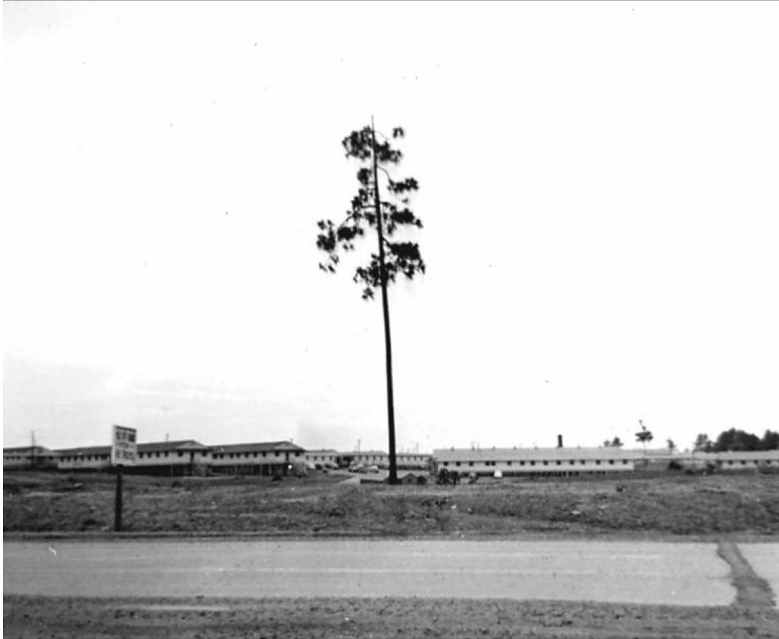
The "Lone Tree" Was Seen From All Over Camp Claiborne. It Appears In The Background Of Many Photographs.