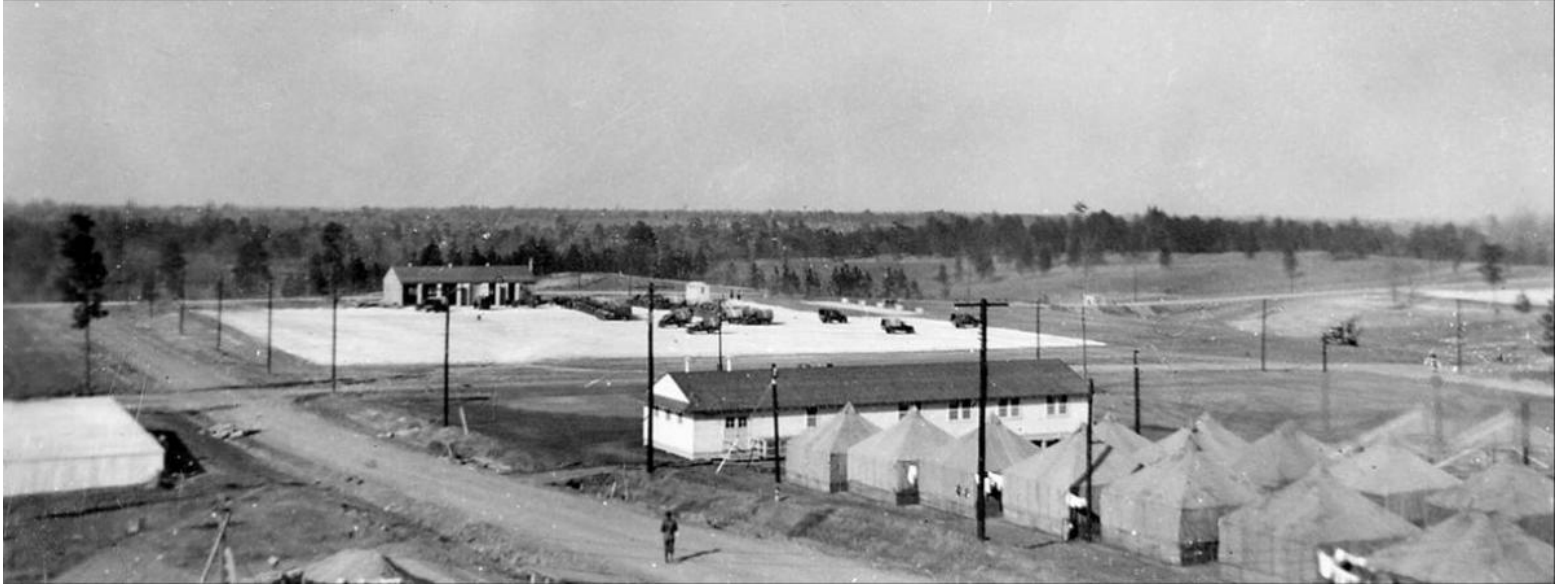
Another Shot Of Camp Living Conditions. The Building In The Background Is Most Likely The 'motor Pool'.