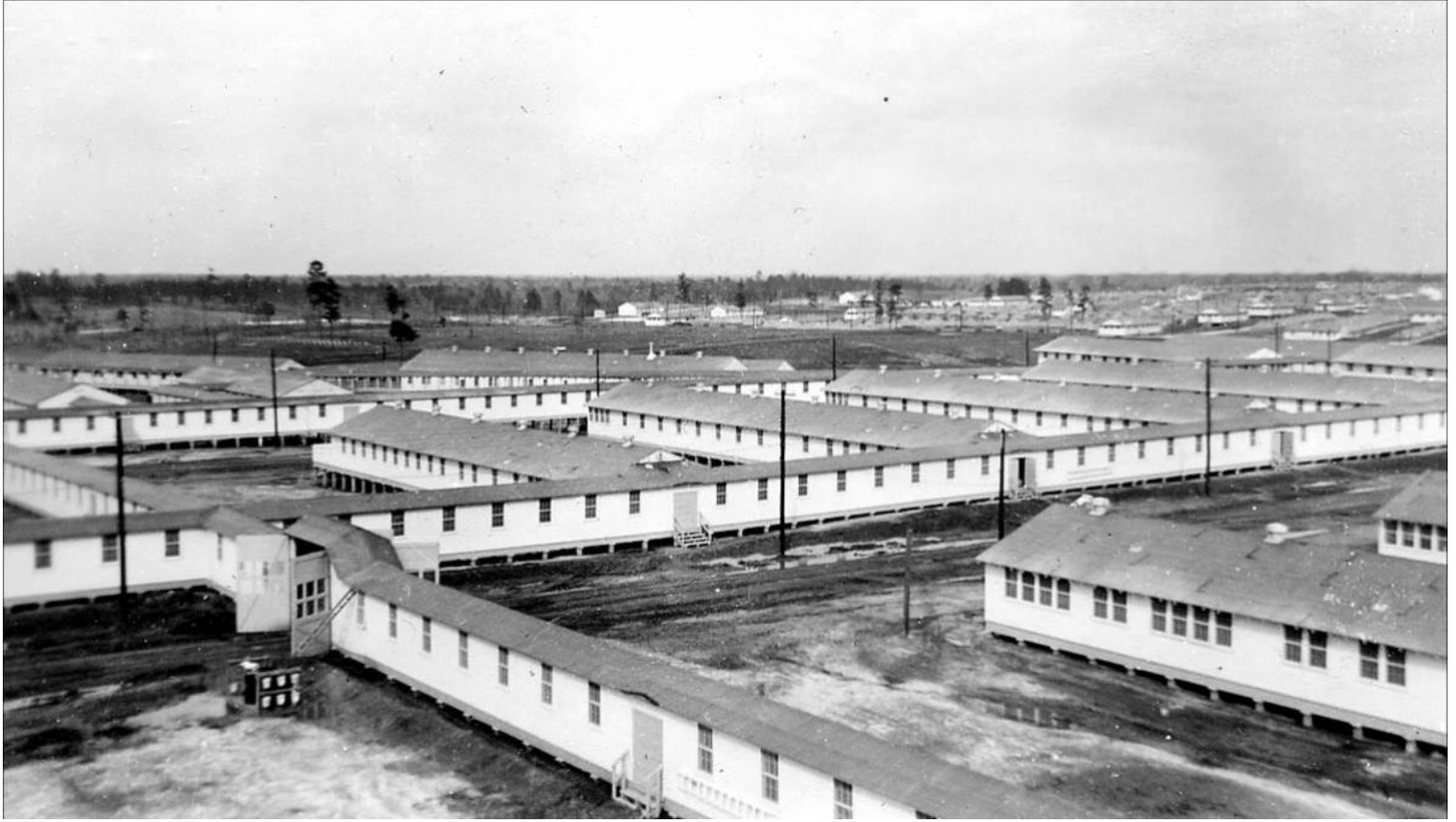
The Wooden Barracks Were Reserved For "Regular" Army Soldiers.