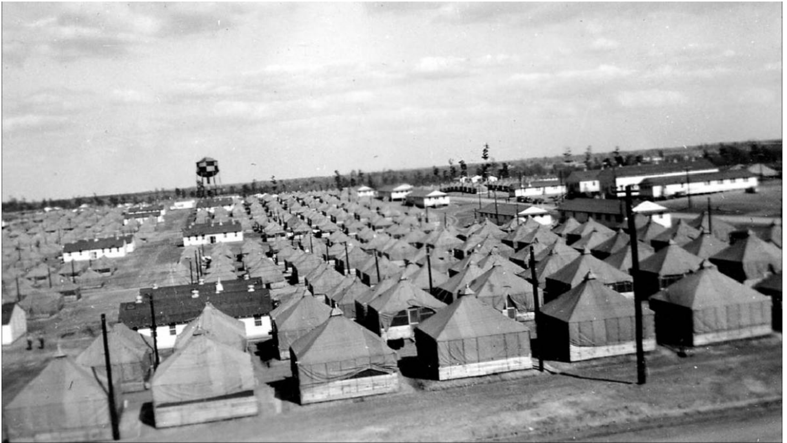
Soldiers From Company K And Other National Guard Soldiers Were Housed In Tents. Note The 'lone Tree' In The Background To The Center Right.